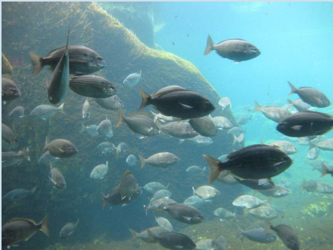
New York Aquarium Fish Display